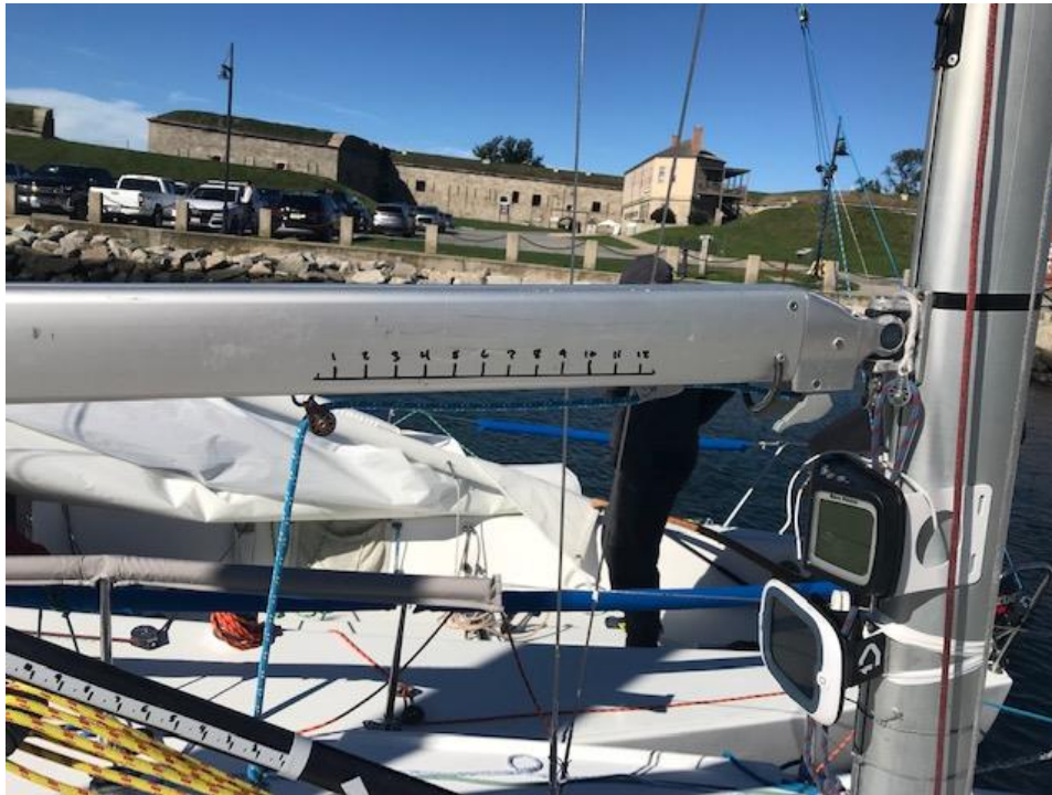
Fig 1. Standard System

Is it permissible to substitute the Builder Supplied Outhaul cleat and pulley on the boom (Fig.1) for another cleat and pulley (Fig.2)?